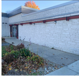
no overhead cover